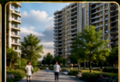
8 FT JOGGING TRACK