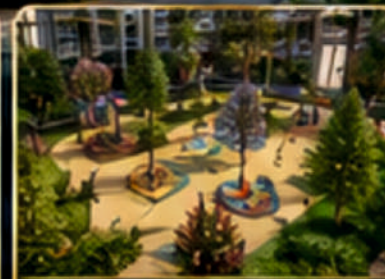
KIDS & TODDLER PLAY AREAS