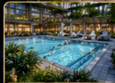
OLYMPICS SIZE SWIMMING POOL