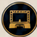
OPEN AIR THEATRE