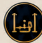
OPEN FITNESS PARK